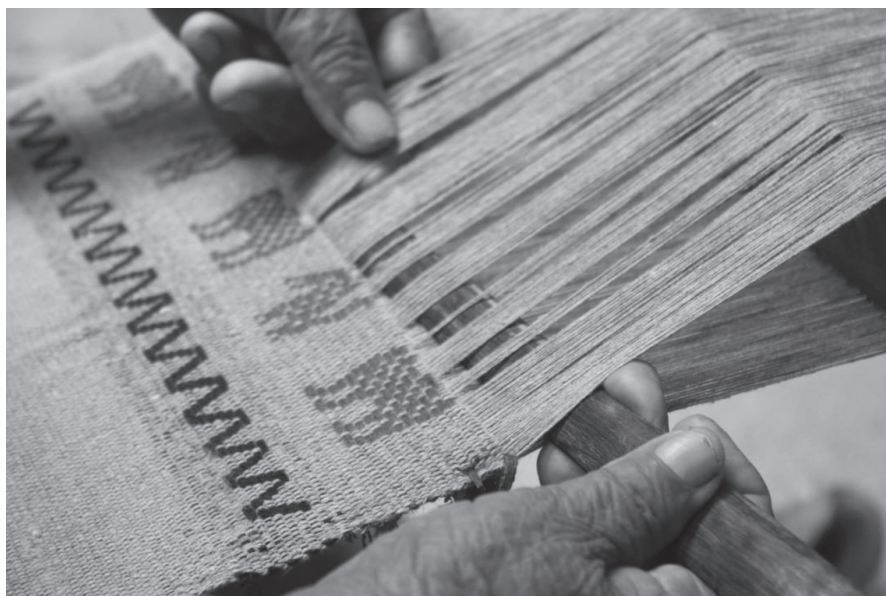
PHOTO 6.5: Ana's grandmother weaving.