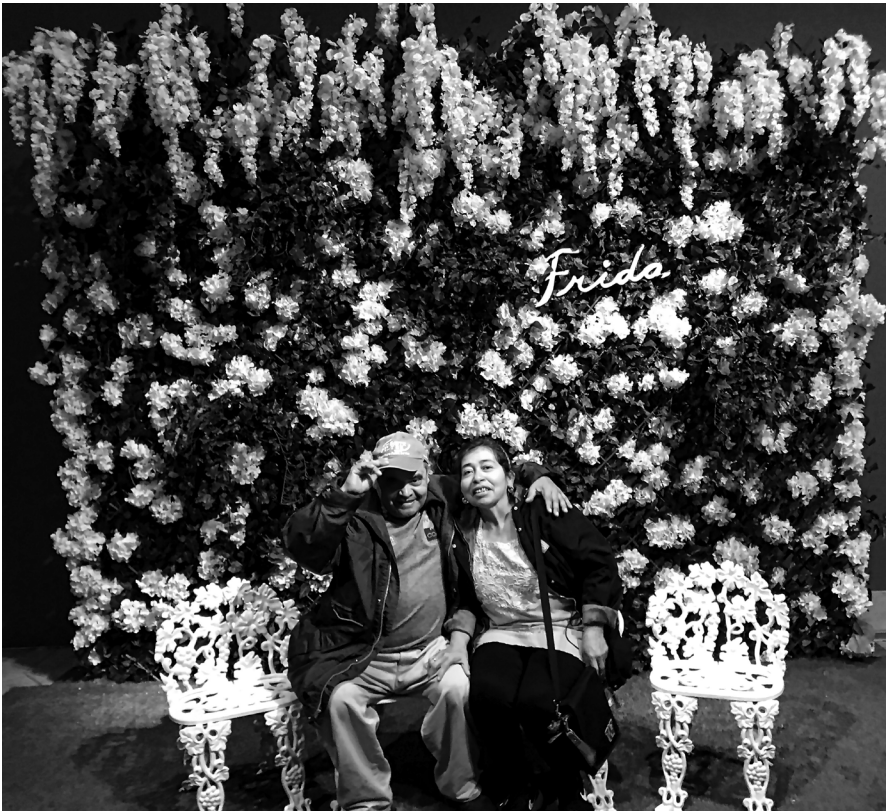
PHOTO 5.1: My father and mother in the Frida Kahlo exhibit.