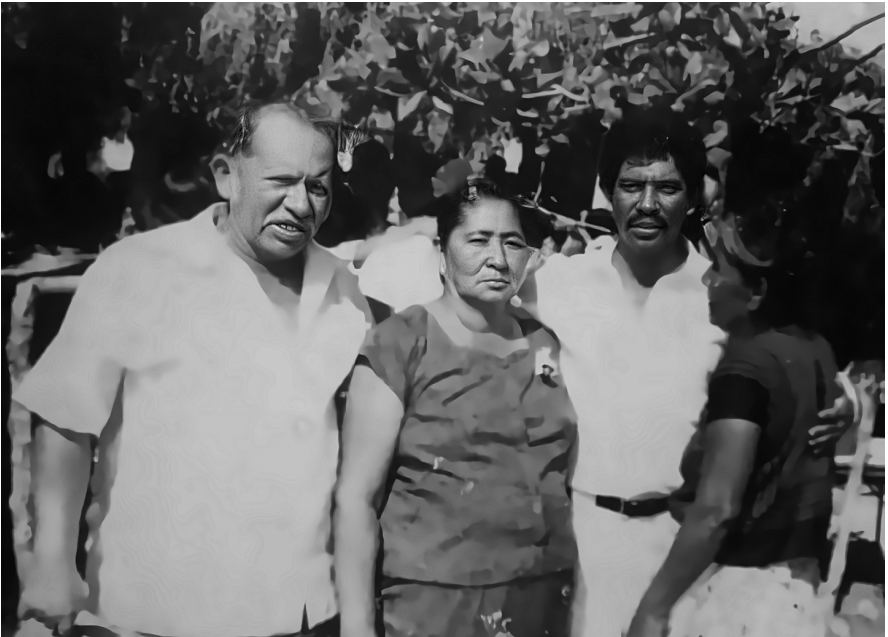
PHOTO 6.1: From left to right, my grandfather, my grandmother, my uncle, and my great aunt.