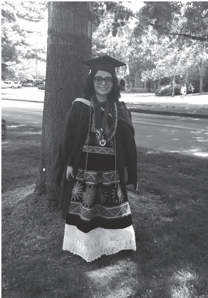
PHOTO 6.3: Wearing my grandmother's huipil passed down to me during my master's graduation.